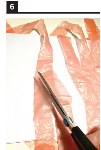
6 Repeat the same diagonal cut across the joined strips. Be careful not to cut through other strips.