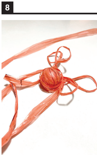
8 As you repeat the process with each bag keep adding more strands to create a ball of plastic thread.