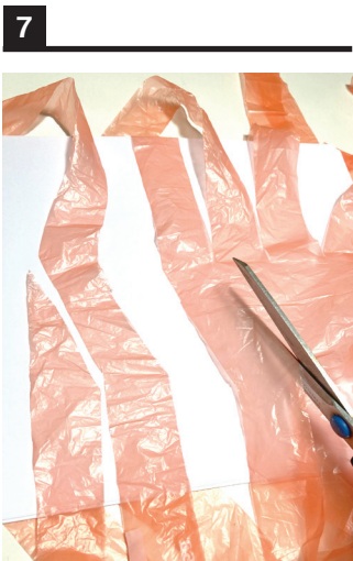
7 As you work it will create one continuous strip. Now your strand is ready to be rolled into a ball.