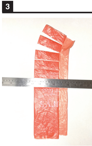
3 Cut into strips about 3cm apart making sure to stop 3-5cm from the folded edge