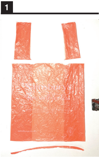
1 Cut off the handles of the plastic bag and the closed edge at the bottom of the bag.