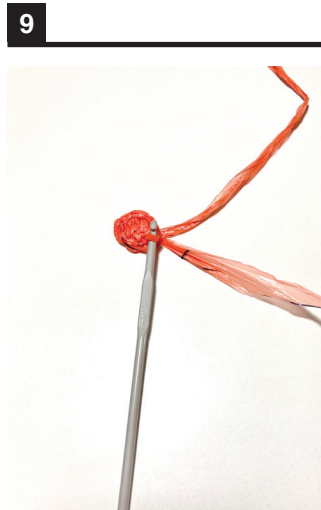
9 This can now be made into anything you can dream up. I started off with a circle made by increasing gradually.