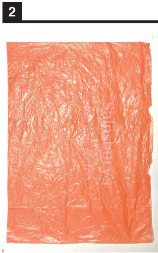
2 Now you have a tube with the open ends at the top and bottom. From the folded edge roll up the bag leaving a gap.