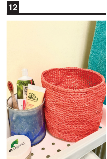
12 It ended up being a recycling bin for my bathroom. Very nifty.