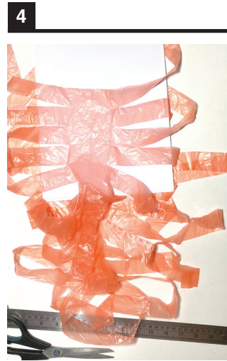
4 One opened up your tube will end up with a spine holding the strips. A piece paper underneath will help.